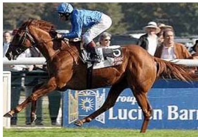
Rio de la Plata