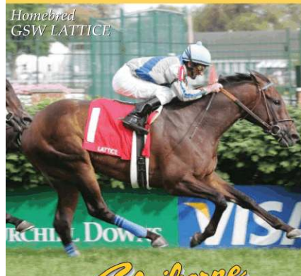
Homebred GSW LATTICE