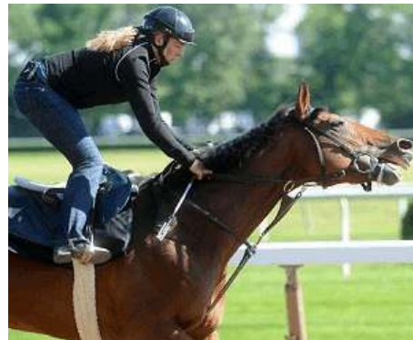
Big Brown

like that, because this is such a huge race. If somebody did something like that they might get assassinated after the race. I just can't imagine that someone would go and do something stupid just to keep us from winning the race. I am under the impression that all the