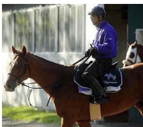
Casino Drive