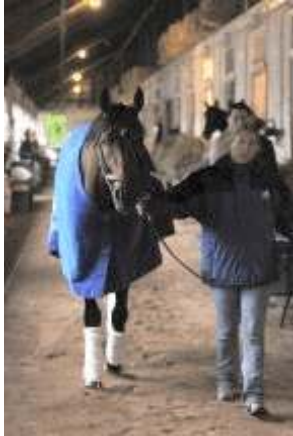
Big Brown