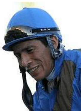
Edgar Prado