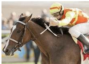
Nashoba's Key (2003-2008)