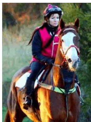
Apache Cat