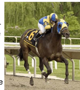
Four Footed Fotos

Click for the brisnet.com chart or the brisnet.com PPs . Video, sponsored by Taylor Made.