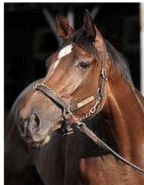
Dream Rush

Dream Rush , a multiple Grade I winner last season, faces the starter for the first time since finishing fifth in the Breeders' Cup F/M Sprint Oct. 26 at Monmouth.