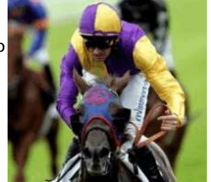
Saoirse Abu