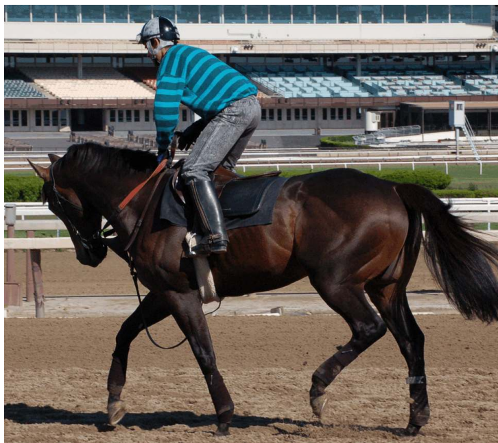
Benny the Bull looking the part at the Big A Friday. The G1 Dubai Golden Shaheen hero is pointing toward the GII True North H. on the GI Belmont S. undercard.