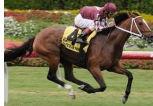
Hostess