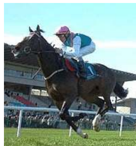
Famous Name

Doubts surround the participation of Khalid Abdullah's Famous Name , who showed a preference for softer ground when winning on debut at Naas in July and while beating subsequent G3 Ballysax S. scorer Moiqen (Ire) by four lengths in the G3 Leopardstown 2000