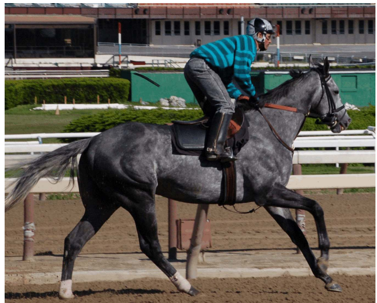
GI Breeders' Cup Mile winner Kip Deville working an easy five furlongs in 1:05.86 at the Big A yesterday. Sherackatthetrack

Golden Glade , g, 4, Gilded Time --Woodmiss, by Woodman. WOX, 5-23, 1mT, 1:35 4/5. B-Louis J & Joan Agro (ON). *C$17,000 yrl '05 ONTSEP. **1/2 to Wood Be Willing (Pulpit), SW, $189,468.