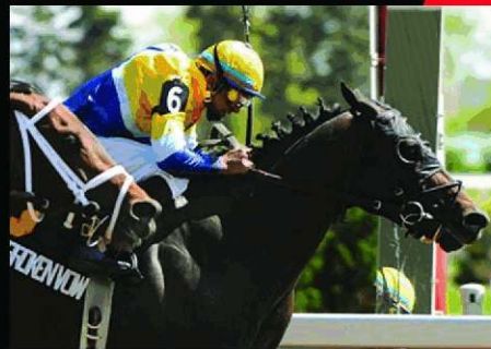
MATT'S BROKEN VOW Wins Grade 3 Marine Stakes at Woodbine