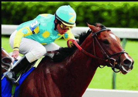
EATON'S GIFT Wins Matt Winn Stakes at Churchill Downs

Congratulations to the connections of Eaton graduates: