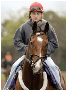
Nownownow