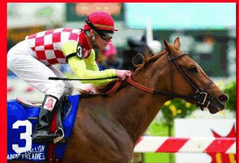
PALANKA CITY Wins Grade 3 Adena Stallions' Miss Preakness Stakes at Pimlico