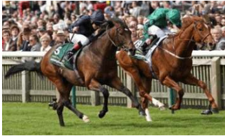
Henrythenavigator (I) tops New Approach