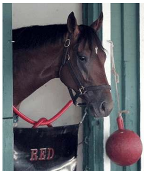
Big Brown