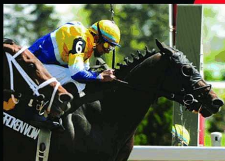
MATT'S GOLDEN VOW Wins Grade 3 Marine Stakes at Woodbine