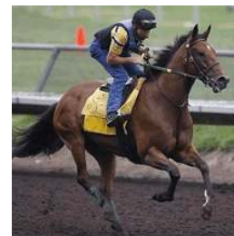
Perfect Drift