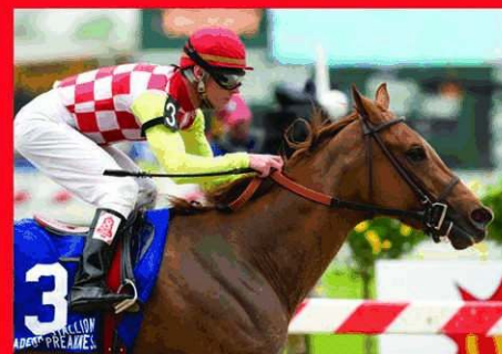
PALANKA CITY Wins Grade 3 Adena Stallions' Miss Preakness Stakes at Pimlico