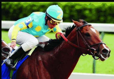
EATON'S GIFT Wins Matt Winn Stakes at Churchill Downs

Congratulations to the connections of Eaton graduates: