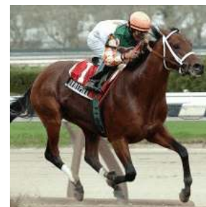
Divine Park