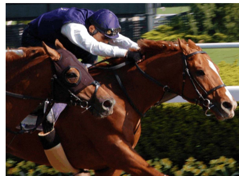
Casino Drive (inside) working at Belmont prior to the Peter Pan Sherackatthetrack

On Sunday, we'll have him go a bit faster with him than he went today, and then next Wednesday he'll work.