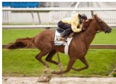
Kentucky Bear