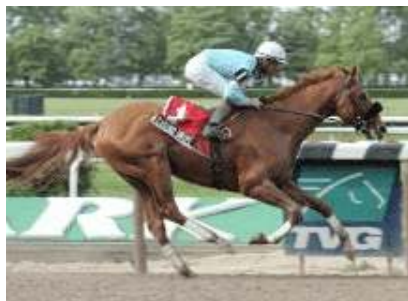
Casino Drive

The legend of Better Than Honour grew further Saturday at Belmont Park when her son Casino Drive (Mineshaft), a 3/4-brother to reigning GI Belmont S. heroine Rags to Riches and a half to 2006 winner Jazil,