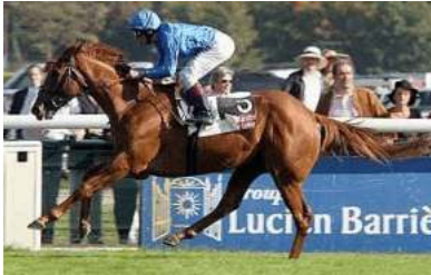
Rio de la Plata le-cheval bleu

This has been a happy hunting ground for the boys in blue in recent times and wins by Vettori (Ire), Bachir (Ire) and Shamardal sit alongside Noverre's disqualification in 2001. Successful in Goodwood's G2 Vintage S.