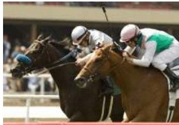
On The Acorn (GB) (outside)

On the Acorn appeared to be a nice allowance horse early in his career before falling into the claiming ranks at the end of his five-year-old season. Haltered by