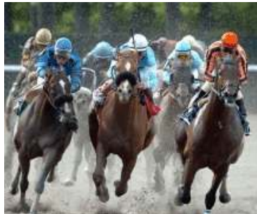
Casino Drive (center) makes his move