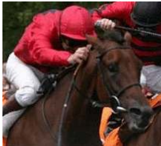
River Proud