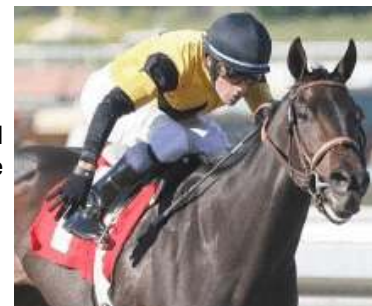
El Gato Malo

El Gato Malo , the only graded-stakes winner in the field, faces 11 rivals as he looks to bounce back after finishing fifth as the favorite in the GI Santa Anita Derby. The speedy Samba Rooster is the morning-line choice after running second in the Apr. 19 GII Coolmore Lexington S. at Keeneland.