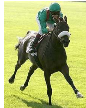
Zarkava