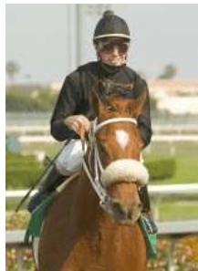
Ashley's