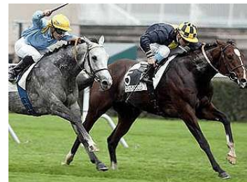
Thewayyouare