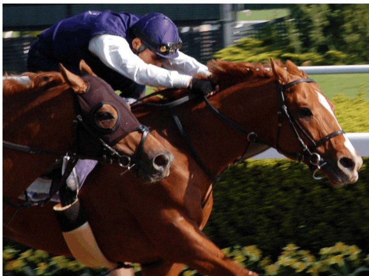
Casino Drive leads Spark Candle in Wednesday morning's workout at Belmont Park

Casino Drive, bred in Kentucky by Shell Bloodstock, will prep for the June 7 "Test of the Champion" in the Peter Pan. Three-time Kentucky Derby winning jockey Kent Desormeaux has the call.