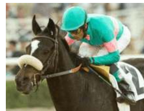
Zenyatta