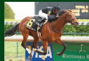
GRADE 3 WINNER RUN AWAY AND HIDE