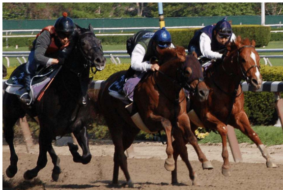
Casino Drive (inside), Spark Candle (middle), Champagne Squall (outside)