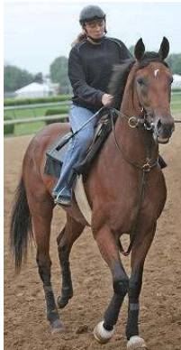
Big Brown at Churchill Wednesday