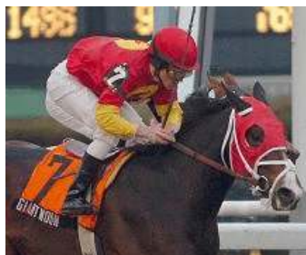
Giant Moon