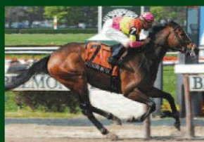
$100,000 WINNER NORTHERN NETTI by 9 1/4 lengths in 1:21 1/5