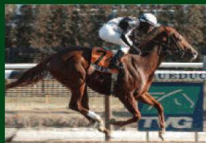
GRADE 1 WINNER BUSTIN STONES