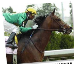
4/25 Woodbine SW BONANZA