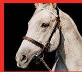
HOLY BULL Sire of Giacomo, 2005.