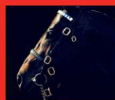
STREET CRY Sire of Street Sense, 2007.