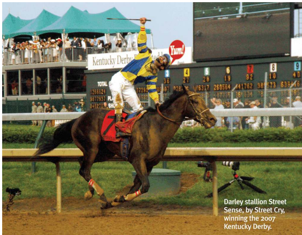
Darley stallion Street Sense, by Street Cry, winning the 2007 Kentucky Derby.

Want to send a "Letter to the Editor" of the Thoroughbred Daily News ? Our address is 27 Monmouth St., Red Bank, NJ, 07701; or send a fax to: (732) 747-8955; or an e-mail to: editor@thoroughbreddailynews.com .