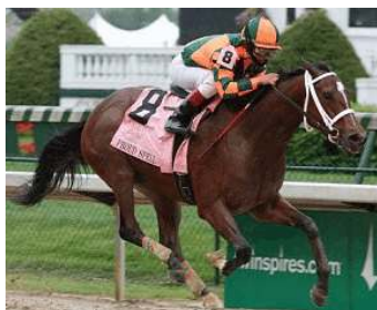
Proud Spell