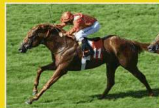
Denali sold STRIKE THE DEAL at FTK July 2006.

Best of luck to the connections of STRIKE THE DEAL in today's Classic Two Thousand Guineas-GI.