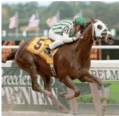
Sharp Cat (1994-2008)

SHARP CAT DIES Multiple Grade I winner Sharp Cat (Storm Cat--In Neon, by Ack Ack) was euthanized Apr. 21 due to complications from a difficult foaling, according to Daily Racing Form . Her A.P. Indy colt has survived. The 14-year-old mare was acquired by Darley for $3.1 million at