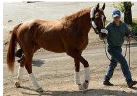
Curlin

Horse of the World Curlin (Smart Strike), who finished third in last year's GI Kentucky Derby, will grace the Derby crowd with his presence today, parading on the Churchill main track as well as a paddock appearance prior to the day's fifth race.