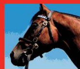
ELUSIVE QUALITY Sire of Smarty Jones, 2004.