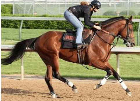
Big Brown