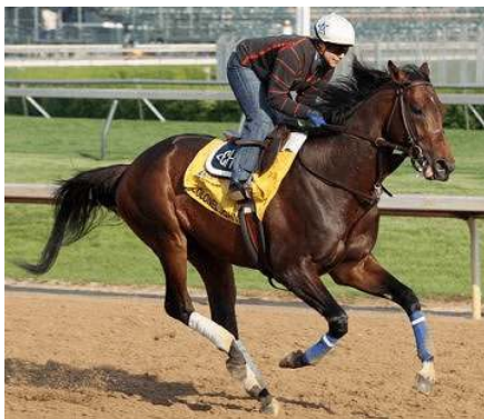
Colonel John