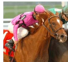
Keep the Peace

Secret Gypsy faces a tough crowd in making her 2008 debut. The chestnut was tabbed as a TDN Rising Star after establishing a new track record of 1:03 1/5 in capturing her career opener at Saratoga Aug. 16, but hasn't raced since. She shows several sharp drills, including a bullet :58 3/5 at Churchill Apr. 22. Her rivals include Keep the Peace , second by a nose in the GII Forward Gal S. at Gulfstream; and Alina , runner-up by 3/4 of a length to Derby hopeful Eight Belles in the GII Fantasy S. Apr. 6 at Oaklawn.