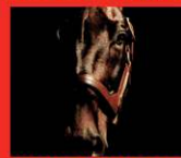
QUIET AMERICAN Sire of Real Quiet, 1998.

Until now, no farm has ever stood four active sires of Derby winners at the same time.