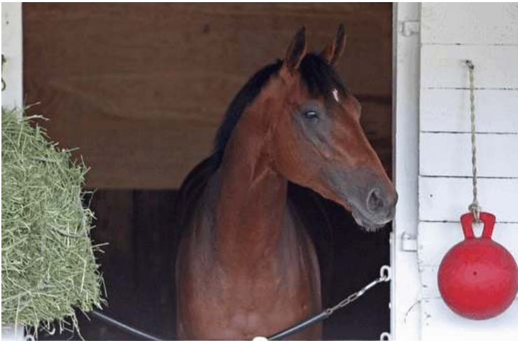
Big Brown Gets A First Look at His Churchill Digs