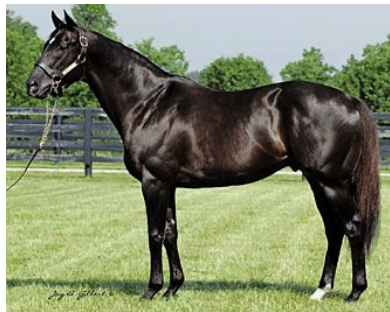
More Than Ready

SESSION More Than Ready over Danehill-line mares has thus far produced Group 1 winners Sebring (Aus) and Benicio (Aus) and a filly bred on the same cross took a starring role on the second day of the Inglis Classic Yearling Sale.