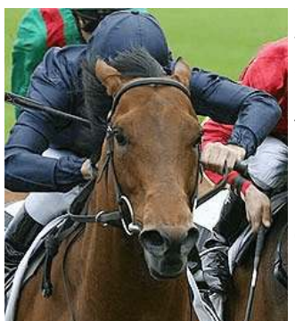
Duke of Marmalade

Entering the G1 Prix Ganay, Duke of Marmalade boasted a sole win in a Curragh maiden in June 2006, but that failed to tell the whole story. Injured following his runner-up placing in the G2 Vintage S. at Good-