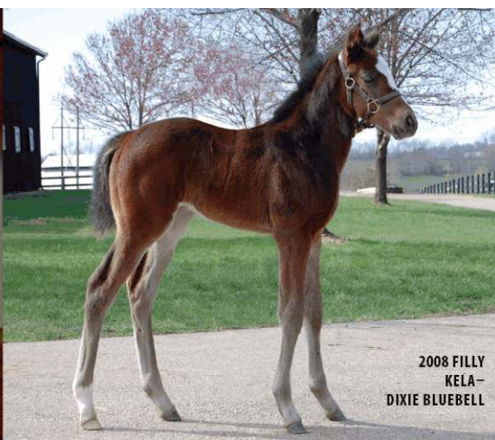
2008 FILLY KELA- DIXIE BLUEBELL