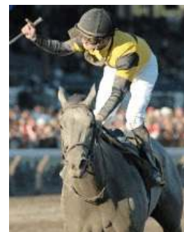
Irish Smoke