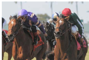
Sporting Art (red cap) tops Flying Dismount

Sporting Art trumped stablemate Flying Dismount by a neck in the GIII Palm Beach S. Mar. 29 at Gulfstream. "It's really hard to choose between the two horses,