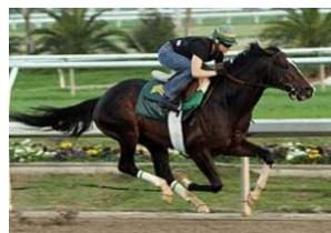
Grasshopper Lou Hodges Jr

Grasshopper (Dixie Union) is scheduled to make his next start on Belmont's opening day in the $100,000 GIII Westchester H. going a flat mile. Runner-up to Street Sense in the GI Travers S. last summer, the dark bay kicked off 2008 with a victory in the GIII Mineshaft H. Feb. 9 before just missing in the GII New Orleans H. Mar. 8. Others pointing to the one-mile