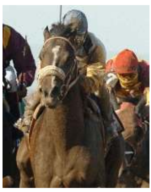
Tale of Ekati A Coglianese

after Big Truck worked at Keeneland, trainer Barclay