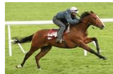
Arqana Topper