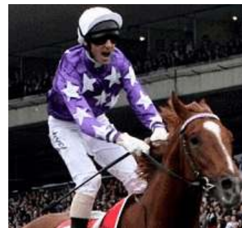
Sebring

Sebring (Aus) (More Than Ready) became the first undefeated winner of the G1 Golden Slipper S. with a determined victory over glamour colt Von Costa de Hero (Aus) (Encosta de Lago {Aus}) at Rosehill Saturday. Favored for this race for the past three months, Sebring looked to have ruined his chances when last of 16 out of the barriers. But the tenacious colt stealthily made up ground before bursting clear in the straight--only to have the shadow of the larger-than-life Von Costa de Hero appear, sprinting from out wide like a freight train. But in a battle of David-and-Goliath proportions, little Sebring pinned his ears back and fought Von Costa de Hero tooth-and-nail to the line. If 30,000 racegoers were uncertain of the result, exuberant jockey Glen Boss was not, raising his whip in a victory salute as a large group of owners decked out in the Star Thoroughbreds purple and white went wild. "Everyone said to me, 'This horse has not run for seven weeks,' and I said 'Why worry about it, he has got one thing on his side, [trainer] Gai Waterhouse,'" Boss said. "He is a special horse; I think when he steps up in distance he is going to get better and better." Cont. p2