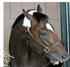
Brother Derek