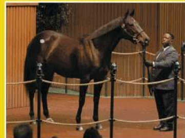
SANTA CATARINA Keeneland Sale Topper

Over the past four years, Denali has sold sale toppers at Saratoga, Keeneland, and Tattersalls.