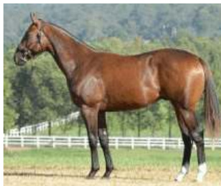
Lot 13 Tyreel Stud photo

The Fleming family's Tyreel Stud is synonymous with Inglis Easter as longtime leading vendor by average. Last year the boutique broodmare farm at Agnes Banks on the Hawkesbury River sold nine at an average of