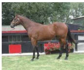
Lot 44

The progeny of Redoute's Choice (Aus) dominated last year's auction, with 57 going under the hammer at an average of A$662,105. He is having a fairly quiet season with seven stakes winners this year, but with