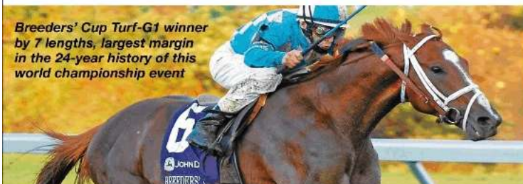
Breeders' Cup Turf-G1 winner by 7 lengths, largest margin in the 24-year history of this world championship event

Includes performances from Oct 1, 2007 through Mar 31, 2008