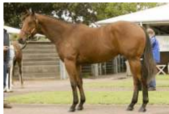
Lot 115

Champion sprinter Fastnet Rock's first crop of yearlings have created immense excitement (54 sold to date this year at an average of A$242,880) and this colt,