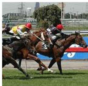
Von Costa de Hero