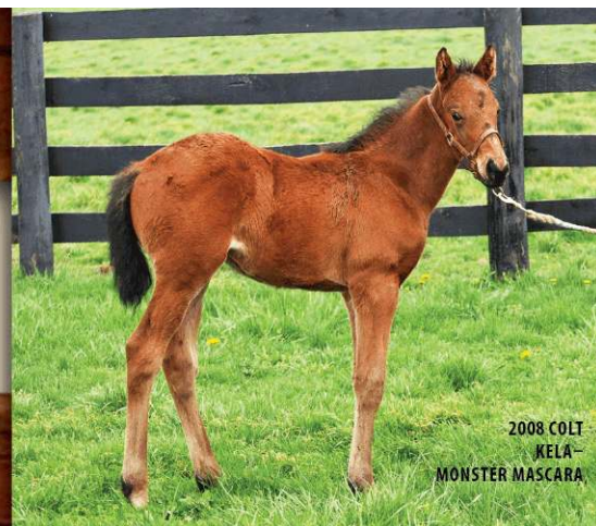
2008 COLT KELA MONSTER MASCARA

A (C) will be used for maiden-claiming races and an (R) will be used for other restricted races.