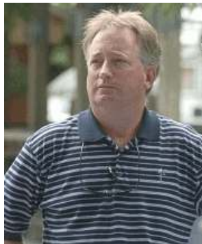
Boyd Browning Horsephotos

BB: "On an immediate level, no. We have the same employees, we have the same management, we're going to be doing the same sales. This transaction is occurring at a very busy time of the year when we are in the midst of yearling recruiting and out hustling yearlings and so forth, and the whole philosophy, fortunately, of both the new buyer and our previous owners has always been of a long-term perspective. There's not going to be any knee-jerk reaction or anything done in an immediate time frame just to make a change. I'm itching to do something--I think your natural inclination is to say, 'Wow, we need to do something.' But there is nothing immediate planned."