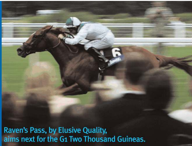
2007 Group-winning 2-year-old, Raven's Pass, by Elusive Quality, aims next for the G1 Two Thousand Guineas.

Don't miss twelve exciting racing prospects by Darley stallions Elusive Quality , Holy Bull , Kafwain , E Dubai and Quiet American in the offering at the OBS Spring Sale of 2-Year-Olds In Training Monday through Wednesday.