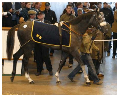
Lot 143 tattersalls.com