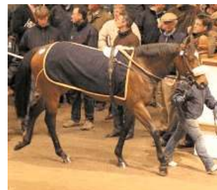
Lot 189