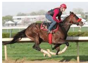
Recapturetheglory Churchill Downs photo