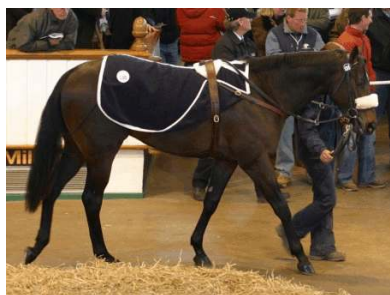
Lot 135