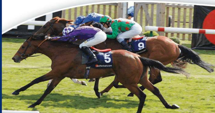
Choisir's sons Stimulation (near-side) & Fat Boy (far-side) show their Classic potential by finishing 1-2 in the European Free H'cap-L.R.