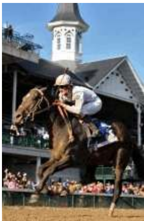
Court Vision