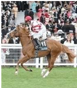
Scintillo (GB)