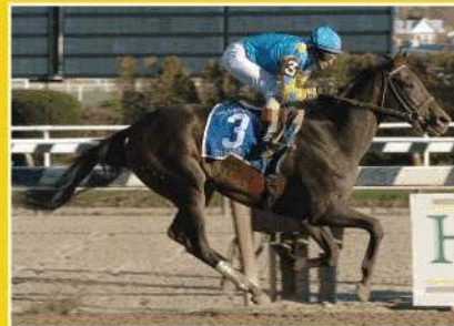
MUSHKA-G2 Saratoga sale topper

Denali was America's #4 Leading Consignor of 2007 Graded stakes winners.