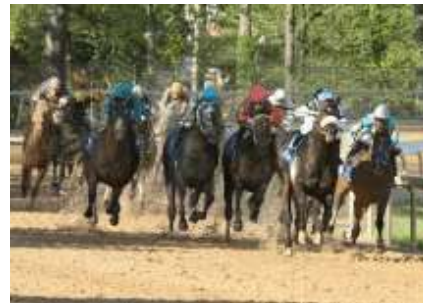
Turning for home in the Arkansas Derby