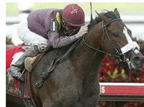
Cool Coal Man