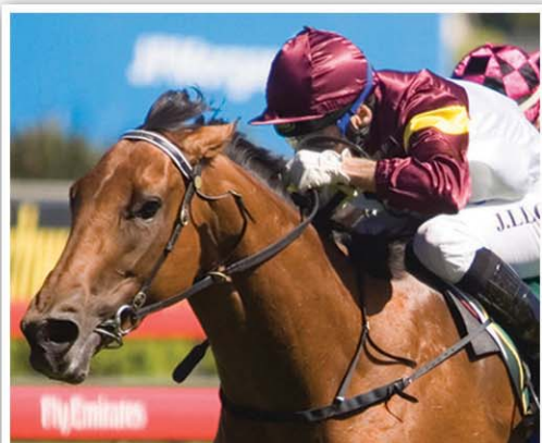
Hurried Choice winning the G2 Challenge Stakes on 1 st March 08