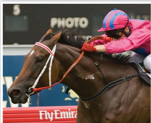
Anatomica, one of the leading contenders for the G1 Golden Slipper