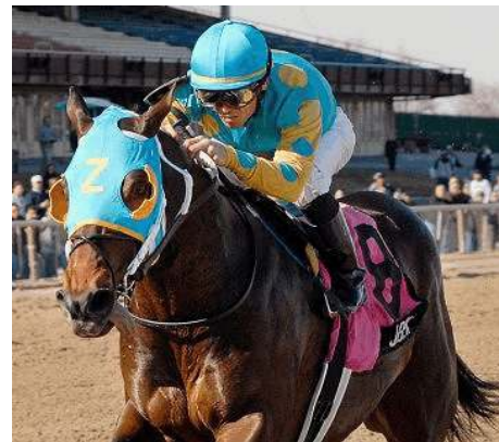
J Be K rolls in the Bay Shore