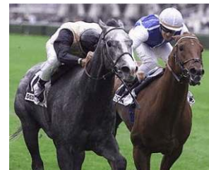
Dedication (1999-2008)