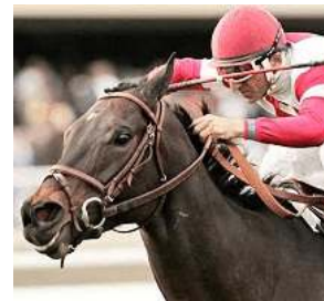
Precious Kitten

Canadian Horse of the Year Sealy Hill makes her 2008 debut. First or second in seven of eight tries last year, the four-year-old filly captured Canada's filly Triple Crown, then ran second in the Sept. 16 GII Canadian S. and in the Oct. 21 GI E.P. Taylor S. The dark bay signaled her readiness with a bullet five-eighths in :58 4/5 on the Keeneland Poly Mar. 31 and a half in :47 2/5 Apr. 6. She faces a solidly Grade I field in her return. Precious Kitten was last seen taking the GI Matriarch S. at Hollywood Nov. 25. Cont. p6