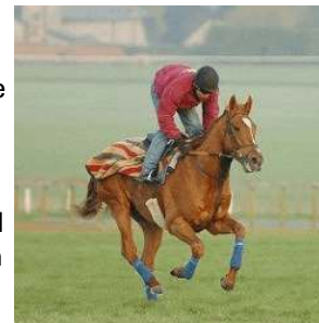
Raven's Pass on Apr. 10