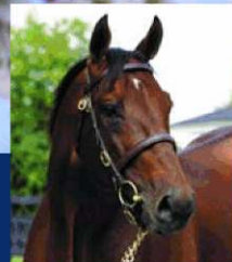
Broken Vow Unbridled – Wedding Vow