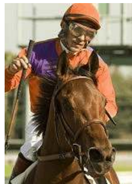
Crown of Thorns