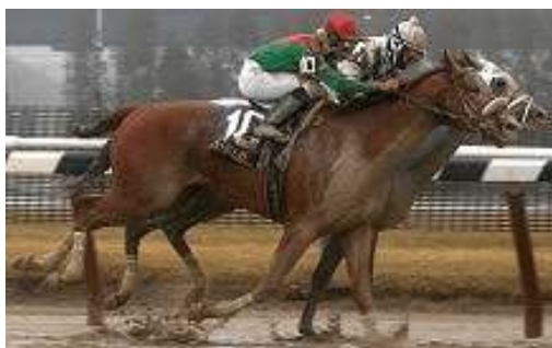
Visionaire (outside)

GIII Gotham S. hero Visionaire (Grand Slam) will break from the far outside when he faces 11 rivals in Saturday's