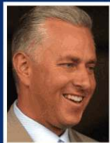
Todd Pletcher, Trainer

"From his very first works he showed us he was a horse of the highest class. He had great tactical speed and a marvelous will to win. He's a Grade 1 winner at 2 and 3 and is also a very correct horse. I have no doubt he will go on and make his name as a top stallion."