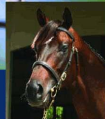
Bob and John Seeking the Gold – Minister's Melody