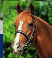
Sky Classic Nijinsky II – No Class