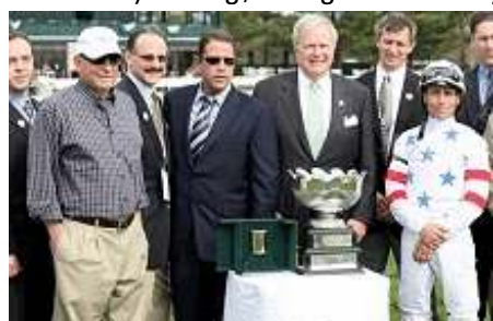
Beaumont Trophy Presentation