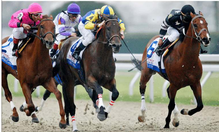
TEUFLESBERG (right) finishes a neck behind subsequent Kentucky Derby-G1 champion STREET SENSE