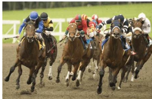
Colonel John (inside, white cap)