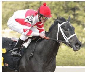
Eight Belles