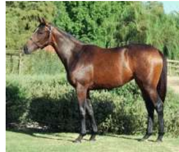
Lot 63 SAHorseracing.com

Friday night's Emperor's Palace National Yearling Sale in Johannesburg broke new ground, posting records for gross receipts (R73 million) and average price (R960,526). A pair of fillies topped the 90-horse opening session, realizing final bids of R3 million. First