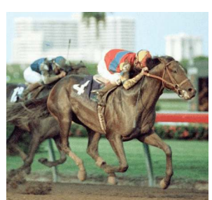
A.P. Indy

They may not have worn the roses, but several Santa Anita Derby winners made history in other ways. The