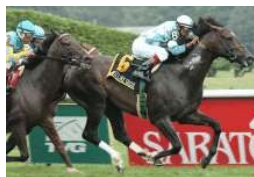
Nobiz Like Shobiz