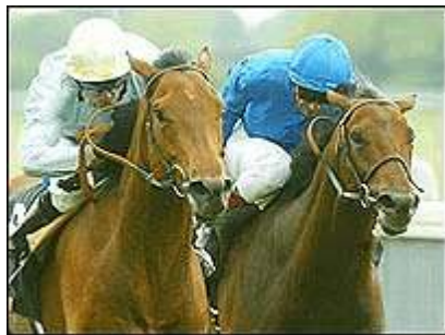
North Light (left)

Part of Miasma's appeal as a broodmare is that her bottom line traces to some famous mares. Her sixth dam was the noted English mare Carpet Slipper, which