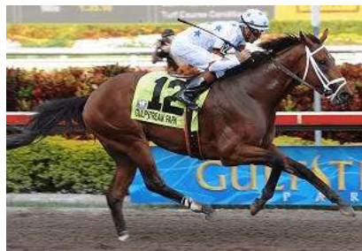
Big Brown

Big Brown is inbred 3x3 to Northern Dancer, who triumphed in both the Florida and Kentucky Derbys, and