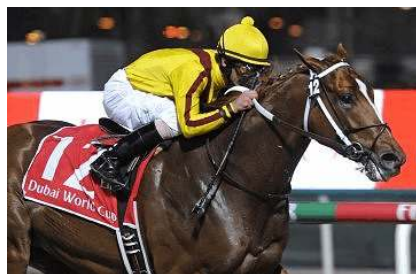
Dubai Racing Club