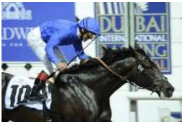
Dubai Racing Club

Godolphin's Jalil (Storm Cat), the $9.7-million KEESEP topper, had his three-race winning streak snapped, crossing the wire a well-beaten seventh in the World Cup. "He was too young," jockey Frankie Dettori said of the four-year-old Jalil. "It was a year too early for him--we will have to wait for next year." Making his dirt debut at Nad Al Sheba in a Feb. 8 handicap, he posted a three-length tally. He followed with a 2 1/2-length handicap win Feb. 21, and posted his biggest career victory to date in the Third Round of the G2 Maktoum Challenge Mar. 6.