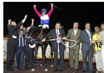
Dubai Racing Club