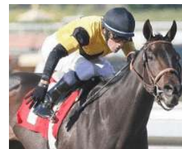
El Gato Malo