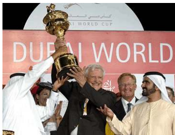
Dubai Racing Club