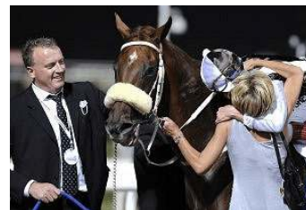
Dubai Racing Club

Sun Classique captured the G1 Fancourt Majorca S. at a mile and the G1 Woolavington 2000 S. at 11 furlongs in South Africa last year, then bid the country goodbye after running seventh (but beaten just 1 1/4 lengths) in the G1 Durban July H. The chestnut opened her Dubai campaign with a handy score in the Feb. 7 Cape Verdi S. under 136 pounds, and was shouldered with 137 in the Balanchine S. 15 days later. Trapped on the rail at the quarter pole, she fought her way out of the