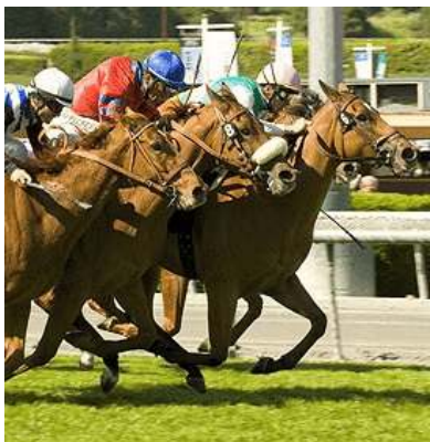
Costume by a head

She had to withstand a jockey's objection, but Juddmonte homebred Costume (GB) (Danehill) came away with her second straight Grade II victory in yesterday's Santa Ana H. on the grass at Santa Anita. It was trainer Bobby Frankel's eighth win in the race. Put on the front by jockey Garrett Gomez, who rode her to victory in the GII Buena Vista H. Feb. 18, Costume was coaxed through uncontested fractions of :23 4/5 and :48 1/5 around the turn and up the back-