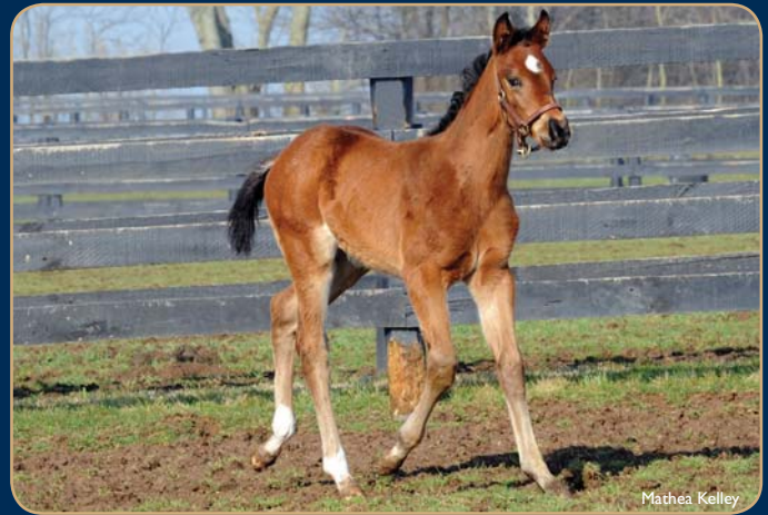
o/o MISTLE SONG Breeder: Bobby Flay Thoroughbred, Weisbord and Etkin