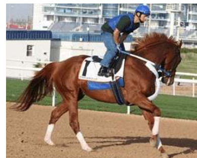
Curlin at Nad Al Sheba Saturday morning