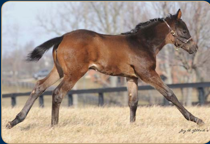
o/o DESERT BLOOM Breeder: TC Stable