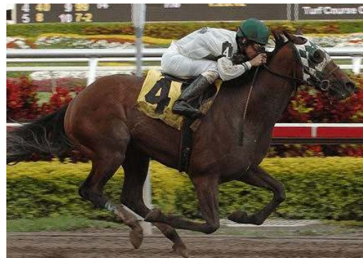
B B Frank