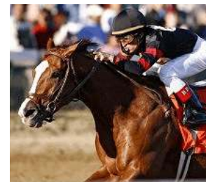
Sugar Swirl