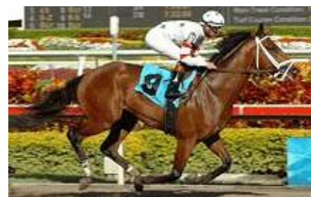
Big Brown