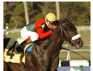
Fierce Wind