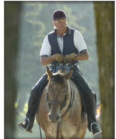
Hall of Fame Trainer Roger Attfield

FIRST-CROP YEARLINGS BY TOMAHAWK SOLD FOR $150,000, $115,000, $110,000, $80,000, ETC.