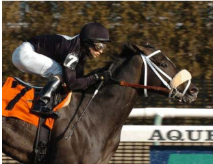
Duke of de Buque

Seeking his third victory in this contest, trainer Todd Pletcher will saddle a pair of runners in Saturday's $500,000 GII Lane's End S., Chitoz (Forest Wildcat) and Duke of de Buque (Dixie Union). The latter will be stepping up from New York-bred company for the first time, but he's a half-brother to Balto Star, who gave Pletcher his first victory in this race back in 2001, when it was known as the Spiral. That gelding established a record winning distance of 12 3/4 lengths since Turfway's marquee event was extended to nine furlongs