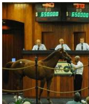
Hip 373