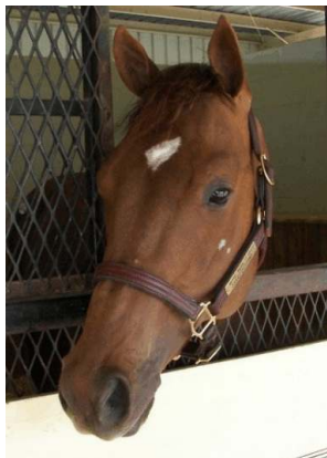
$650k More Than Ready