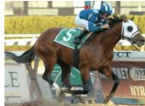
Daaher

Shadwell Stable's Daaher (Awesome Again--Irish Cherry, by Irish Open), who defeated GI Breeders' Cup Sprint and Eclipse Award winner Midnight Lute in the GI Hill 'n' Dale Cigar Mile H. last Nov. 24, has been retired from racing and will enter stud for the current breeding