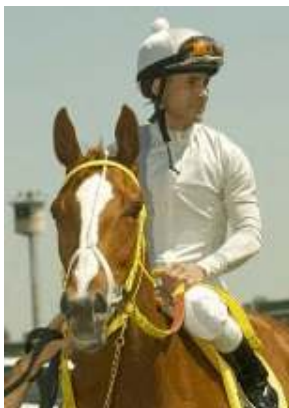
Magnificience