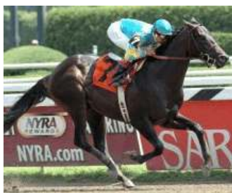
Maimonides