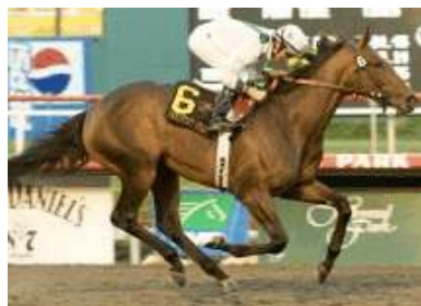
Country Star