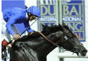
Dettori & Jalil