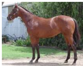
Lot 418 www.inglis.com.au