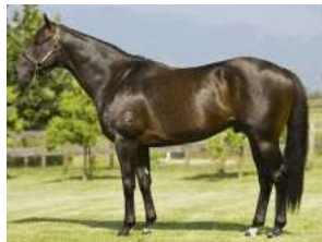
Al Maher emiratespark.com.au