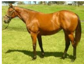
Lot 489

Group 3 winner Fuss (Aus) has gotten off to a slow start as a broodmare, with one racetrack representative--winner Widow Tillane (Aus)--from her first three foals. But her career is could well be revived with this fetching bay filly by Exceed and Excel (Aus), whose progeny are selling like hotcakes off the back of the success of his first two-year-olds this season. He has