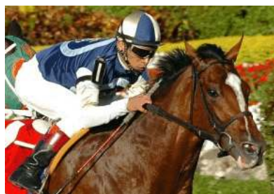
Buffalo Man A Coglianesi

Trainer Cam Gambolati sent out Buffalo Man to a four-furlong work in :50 1/5 over the sod at Palm Meadows yesterday. Buffalo Man is trying to build off