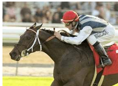
Ten Meropa

Ten Meropa and Gattopardo belong to Johannesburg's second crop, which also contains Eaton's Gift,