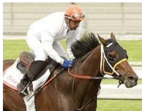
Choctaw Nation