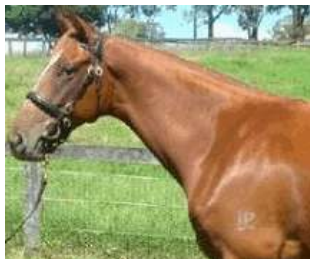
Hip 27 www.inglis.com.au