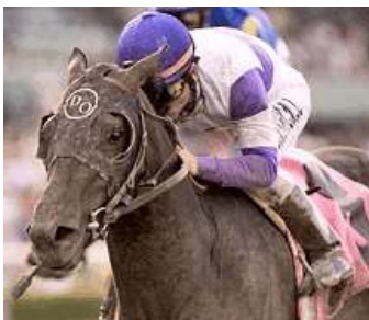
Great Hunter