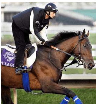
Tiago