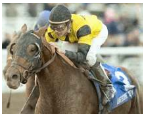
Awesome Gem