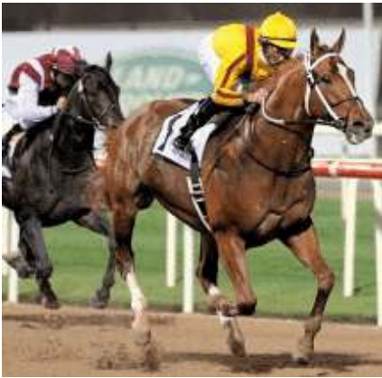
Curlin Dubai Racing Club

Reigning U.S. Horse of the Year and champion three-year-old Curlin (Smart Strike) made a stylish return to the races yesterday, galloping to an easy 2 1/4-length victory in the Jaguar Trophy H. at Nad Al Sheba in Dubai. Connections are hoping the 1 1/4-mile race will set the champion up for the Mar. 29 G1 Dubai World Cup. "That was just what we wanted," trainer Steve Asmussen said after watching Curlin win his first start since last year's GI Breeders' Cup Classic. "In racing, you are always cautiously optimistic, but that's what we expected." Curlin broke from the two hole in the six-horse field yesterday and appeared rank in the early going, tugging jockey Robby Albarado along as they raced over the top of the triangular Nad Al Sheba course.