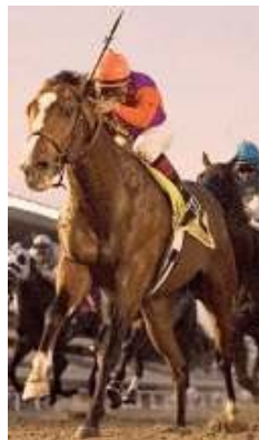
Into Mischief