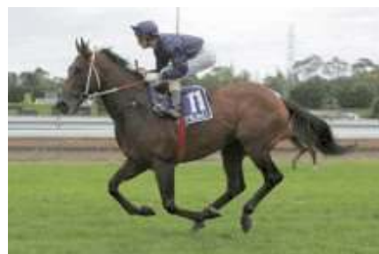
Fastnet Rock