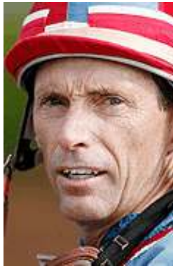
Russell Baze