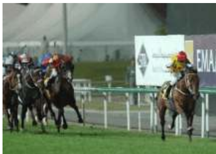
Elvstroem lengthens away to win the G1 Dubai Duty Free in 2005