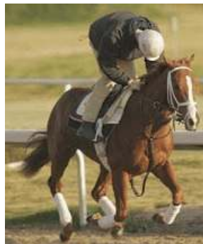
Circular Quay

Circular Quay proved to be a reliable off-the-pace runner earlier in his career, highlighted by eye-catching victories in the GIII Bashford Manor S. and the GI Hope-