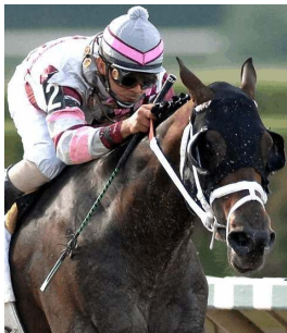
Wise Answer

Is this year's GI Haskell hero in the field? The last two winners of the Monmouth headliner--Any Given Saturday last year and Bluegrass Cat in 2006--proved victorious in this contest. Calder sensation Wise Answer swept three stakes races, including a 10-length triumph in the FSS In Reality S. Oct. 13, but could only finish third when cut back to seven furlongs in the Jack Price Juvenile S. Nov. 10. A turf venture didn't work out, either, as he ran seventh in the Gill Tropical Park Derby Jan. 1, but the J D Farms