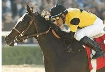
El Gato Malo

El Gato Malo (El Corredor) and Crown of Thorns (Repent) continue to prepare for a tilt in the Mar. 1 GIII Sham S. Perfect in three career starts, the Jan. 12 GIII San Rafael S. victor worked six furlongs over the Hollywood Cushion in