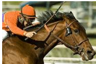
Crown of Thorns