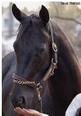
Stormin Normandy Sherackatthetrack