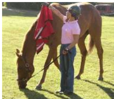
Karakorum Starlet

The attractive chestnut was winless in four starts at two before graduating by nearly 14 lengths in her first sophomore start in 2006, and completed that season with three wins from four outings, all in state-bred company. After venturing outside restricted competition in early 2007, she returned to Empire-bred stakes competition and gave the stable one of its bigger thrills, winning the Union Avenue S. at Saratoga