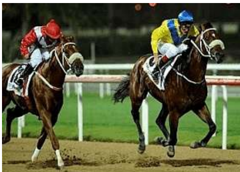
Honour Devil winning the G3 UAE 2000 Guineas