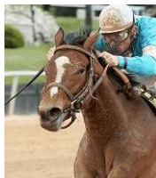
High Heels