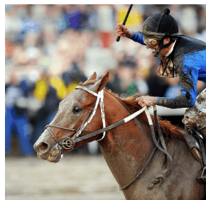
Curlin winning the 2007 BC Classic