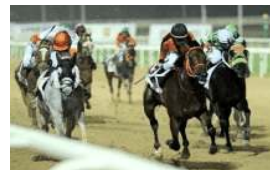
Star Crowned (black cap)