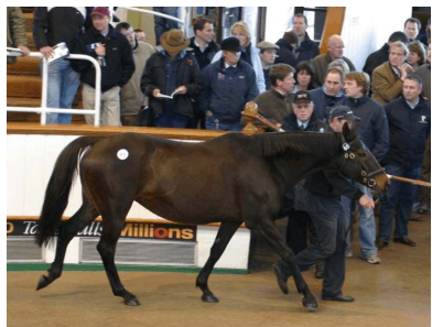
House in Wood - Top Lot

House In Wood (Fr) (Woodman), the dam of the ill-fated GI Garden City S. heroine Alexander Tango (Ire) (Danhill Dancer {Ire}), topped yesterday's one-day