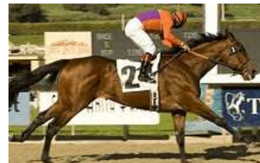
Crown of Thorns