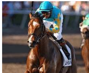
Eaton's Gift

Southern California and stretched to two turns for the GI CashCall Futurity at Hollywood Dec. 22, the bay set the pace for a half mile before tiring to finish seventh. He cut back to one turn here and quickly showed the early way beneath Kent Desormeaux, rattling off fractions of :21.99 and :44.20.