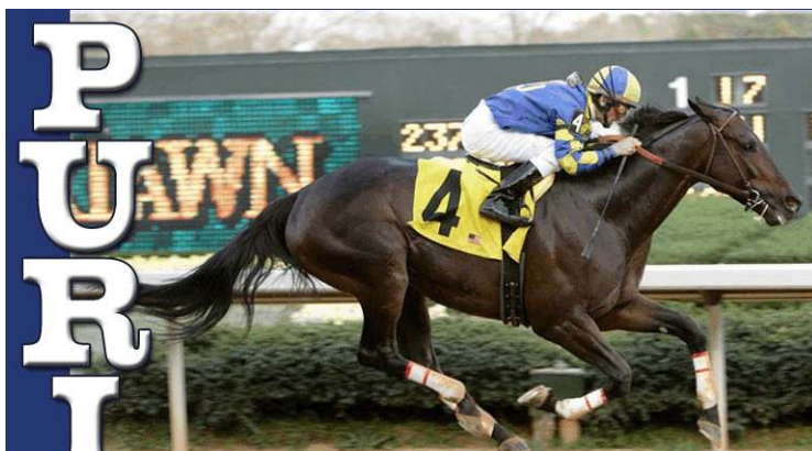
PURIM winning the G3 RAZORBACK

PURIM $10,000 LF First G1-winning son of DYNAFORMER to stand in Kentucky