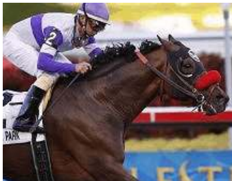
Spring at Last