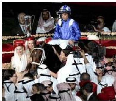
Invasor in Dubai

The GI Donn H. at Gulfstream Park has become a definitive prep race for the G1 Dubai World Cup. Since