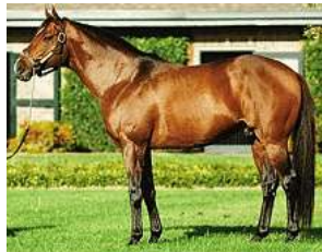
Victory Gallop www.stallionregister.com

VICTORY GALLOP TO TURKEY Victory Gallop (Cryptoclearance--Victorious Lil, by Vice Regent), who denied Real Quiet the Triple Crown with a narrow vic-