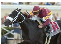
Georgie Boy