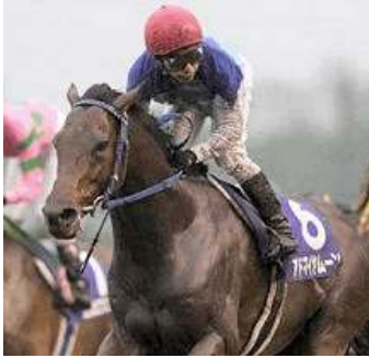
Horse of the Year Admire Moon

Japan's late-developing Admire Moon (Jpn) (End Sweep), winner of three Group 1 races in 2007, including the G1 Dubai Duty Free, was last night named the Japan Racing Association's 2007 Horse of the Year. The four-year-old was also named champion older male. Admire Moon received 178 out of 289 possible votes for Horse of the Year, and was the overwhelming winner of top older male with 249 votes. After scoring his first Group 1 victory overseas in the Duty Free in March, he returned home and triumphed in two more prestigious races, the G1 Takarazuka Kinen and G1 Japan Cup. He is now retired to stud at Sheikh Mohammed's Darley Japan Farm Co. in Hokkaido. Daiwa Scarlet (Jpn) (Agnes Tachyon {Jpn}) was runner-up in Horse of the Year voting and was honored as champion three-year-old filly. Cont. p2