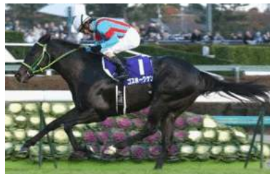
Bernstein's son Goshawk

There were a number of Special Awards presented, including a pair that went to Vodka (Jpn) (Tanino Gimlet {Jpn}) and Meisho Samson (Jpn) (Opera House {GB}). Vodka became the first filly to win the Tokyo Yushun (Japanese Derby), while the latter made his