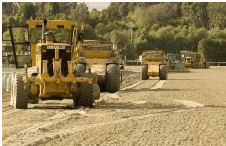
Santa Anita Track Work