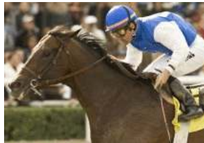
In Summation