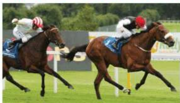
CASUAL CONQUEST - (bred/owned by Moyglare Stud Farm & trained by Dermot Weld) makes a winning debut in a "hot" maiden at Leopardstown.