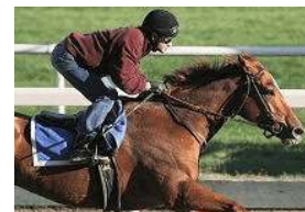
Ginger Punch