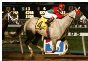
Diamond Stripes

Diamond Stripes (Notebook) has been installed the 7-2 morning-line favorite for Saturday's $1-million Sunshine Millions Classic. The Classic is one of four races in the interstate challenge carded for Santa Anita, while Gulfstream Park will host an additional four races. A winner of five of 10 starts, Diamond Stripes captured last year's GII Meadowlands Breeders' Cup S. and was third in the G1 Stephen Foster H., G1 Whitney H. and GII Woodward S. He has been off since running third in the GII Clark H. at Churchill Downs Nov. 23. Cont. p2