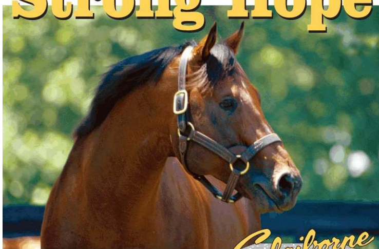
$30,000 Live Foal

Clairborne (859) 233-4252 www.clairbornefarm.com