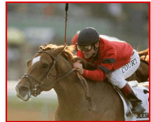
Champion Turf Male LEROIDESANIMAUX

Privately last autumn he bought his partners a yearling half-sister to 2007 Eclipse Award winner