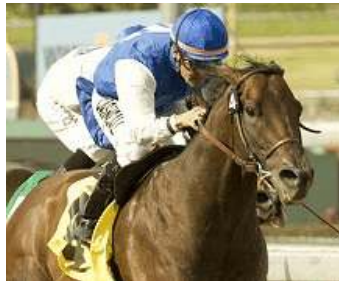
In Summation

A field of seven was drawn yesterday for Monday's GII Palos Verdes H., but it didn't include likely sprint champion Midnight Lute (Real Quiet). "He would have to gut it out going six furlongs, and I don't think he's ready for it," trainer Bob Baffert told Daily Racing Form . "He worked so good last week that I got excited. But it's a long year, and I don't want to get ahead of myself. We'll stick to our original plan [the GII San Carlos H. Feb. 16]." In Summation (Put It Back), winner of the GI Bing Crosby H., has been assigned the rail. He was last seen annexing the GIII El Conejo H. Jan. 1. MGSW Surf Cat (Sir Cat) has been assigned the two slot. The six-year-old has been on the sidelines since finishing fifth in the GII Oak Tree Mile Oct. 7. El Conejo runner-up Barbecue Eddie (Stormy Atlantic) will exit from the three stall.