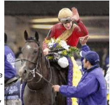
Nownownow