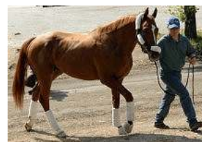
Curlin

GI Preakness S. hero since his win in the GI Breeders' Cup Classic Oct. 27. He turned in a pair of four-furlong breezes at Fair Grounds Jan. 6 and Jan. 12.