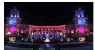
Gulfstream in 2007

Gulfstream was forced to cancel the last two races on the card yesterday due to a power failure just before the seventh race and again during the race itself, according to Daily Racing Form . Track President Bill Murphy told the publication that there were two power surges. "At this point all we know is that a situation occurred somewhere in our vicinity, but not on the track grounds, which led to power surges which first cut off our regular supply of power to the track and then the backup generator, which had kicked in following the original surge," he said. Power was restored to parts of the facility by early evening. The casino was also forced to be shut down. Racing is expected to resume today.