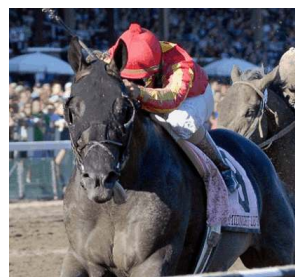
Midnight Lute at Saratoga

MIDNIGHT, MONDAY, MLK Midnight Lute (Real Quiet), widely expected to be crowned champion sprinter at Monday's Eclipse Awards, will have his 2008 opener earlier that day in the $150,000 GII Palos