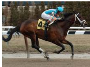
Fleet Indian

There are similarities--and some big differences--between Indian Blessing and Fleet Indian. The similarities include the fact that both these daughters of Indian Charlie are out of mares by speedy Mr. Prospector-line stallions. That speed is very evident in Indian Blessing, who has barely been headed in four starts, the latest in the GII Santa Ynez S. two days ago. Although she was close to being caught at the