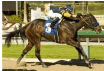
Indian Blessing

The record books show that any filly good enough to triumph in the Breeders' Cup Juvenile Fillies has an almost divine right to head the voting for the Juvenile