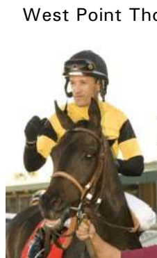
El Gato Malo