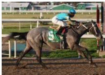
Z Fortune

Z Fortune had all 'z' right moves in his first start outside of New York-bred competition yesterday, employing new rating tactics en route to a good-looking victory in the Lecomte. The Zayat runner was a 5-1 chance in his seven-furlong debut versus fellow state-breds at Belmont Park Oct. 20 and exploded down the